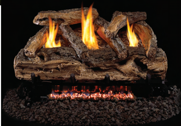
Split Oak S9-24