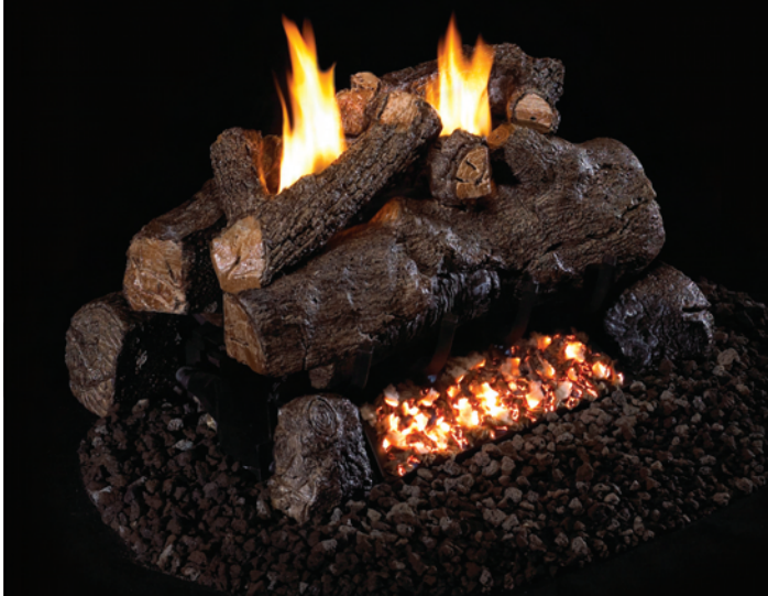
Evening Fyre See-Thru EFV-2-16/18