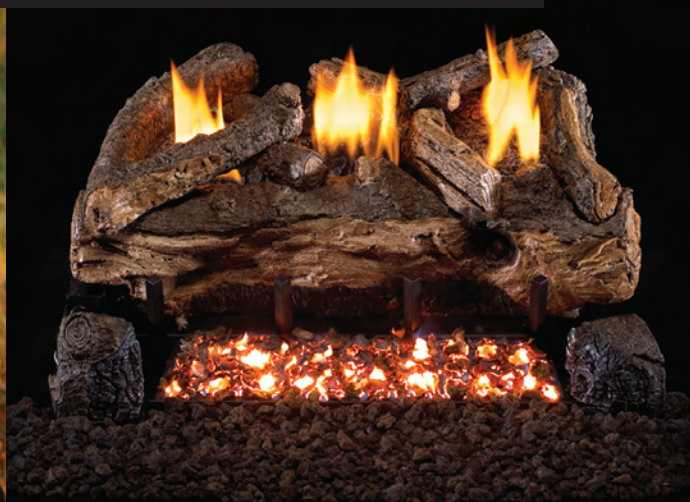
Evening Fyre Split ESV-24