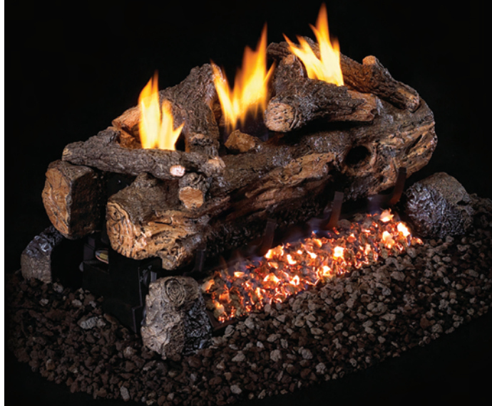
Evening Fyre Split See-Thru ESV-2-24