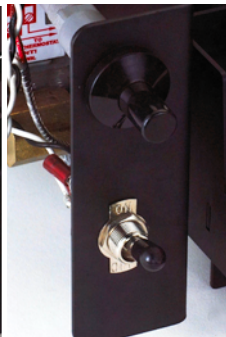
On/Off Remote Control (-12)