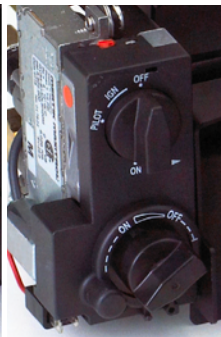
Variable Remote Control (-15)