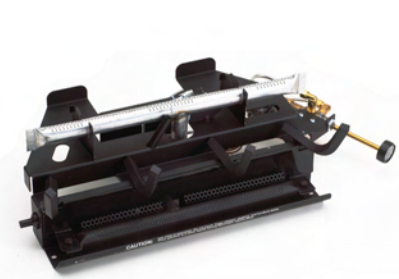
G9-20/24/30 Gas Burner with manual control

A manual control, remote on/off control(-12) and remote with variable flame adjusted control (-15) are available. Add the control number suffix to the model number if a remote control is desired (e.g. RDG9-24-12).