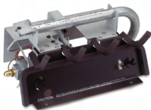
G8-16/20/24-12 Gas Burner with on/ off remote

A manual and remote on/off (-12) control are available. Add "-12" to the model number if a remote control is desired (e.g. VOG8-24-12).