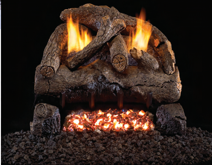
Evening Fyre EFV-16/18