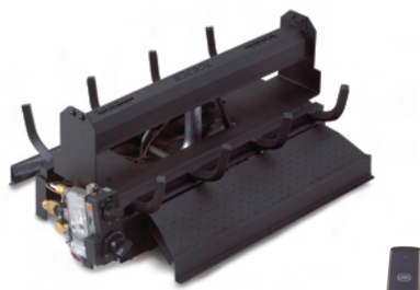
G18-2-24/30-15 See-thru Gas Burner with variable flame height remote