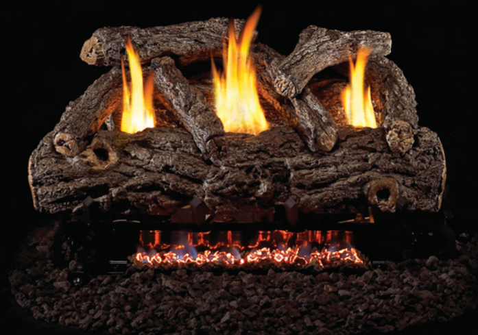
Golden Oak Designer RD9-24