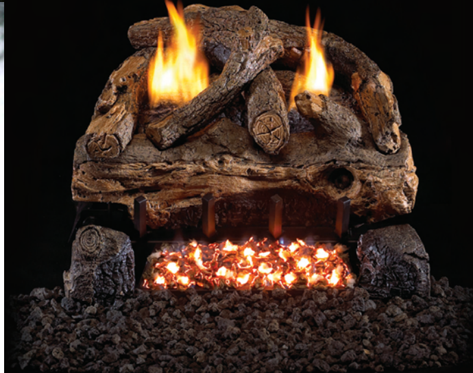
Evening Fyre Split ESV-16/18