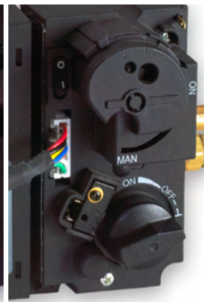
Electronic Control (-01V)