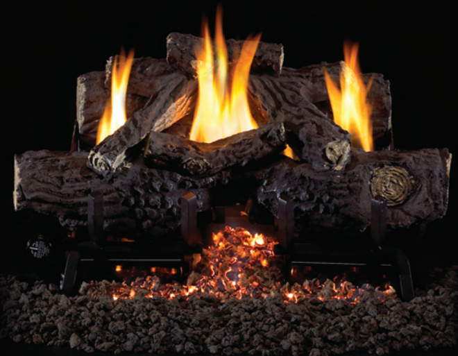
Charred Trail Oak CHT-24