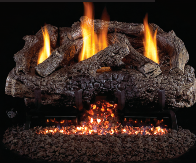
Charred Frontier Oak CHCR-24