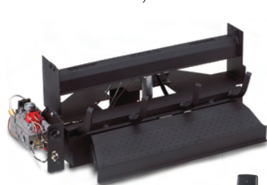
G18-24/30-12 Gas Buner with on/ off remote

A number of control options are available including manual, remote on/off (-12), remote with variable flame height control (-15) and electronic remote with variable flame height control (-01V). Control number suffix should be added to the model number following the size indicator (e.g. EFGV18-24-01V).