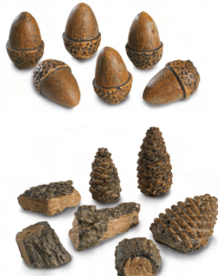
Pine Cones (PC-4), Acorns (AC-6), Wood Chips (WC-6), Assorted Decor Kits (DP Series) & Crackler (CC-1) (not shown)