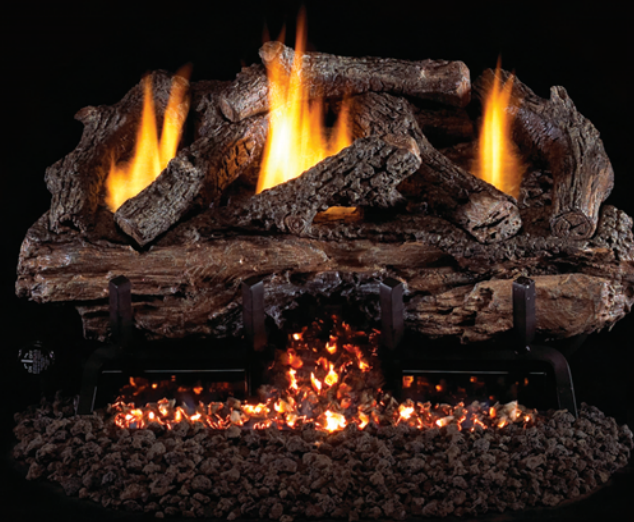
Charred Aged Split Oak CHAS-24