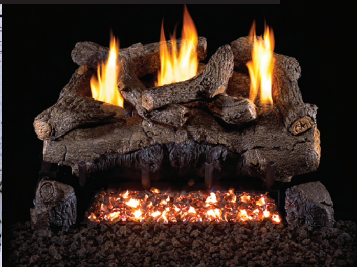
Evening Fyre EFV-24