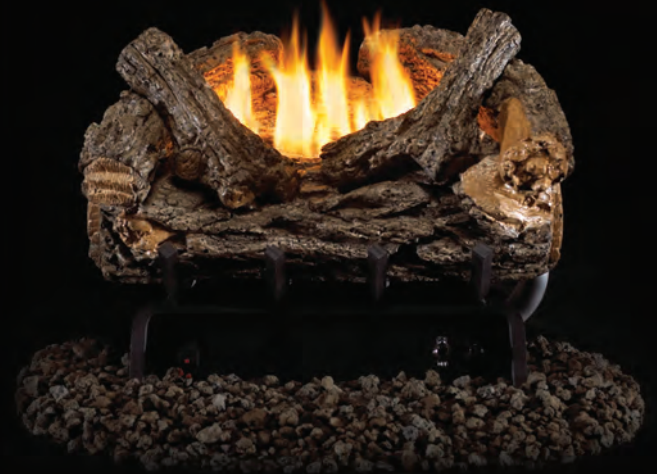
Valley Oak VOG8-16