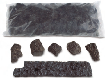
Optional Decorative Kit (DP-4): Sold separately.